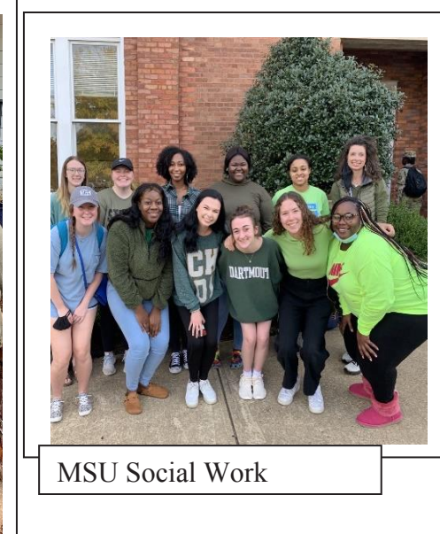
MSU Social Work